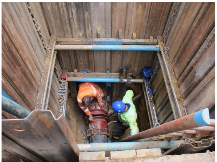
Standby tankers keeping excavations clear