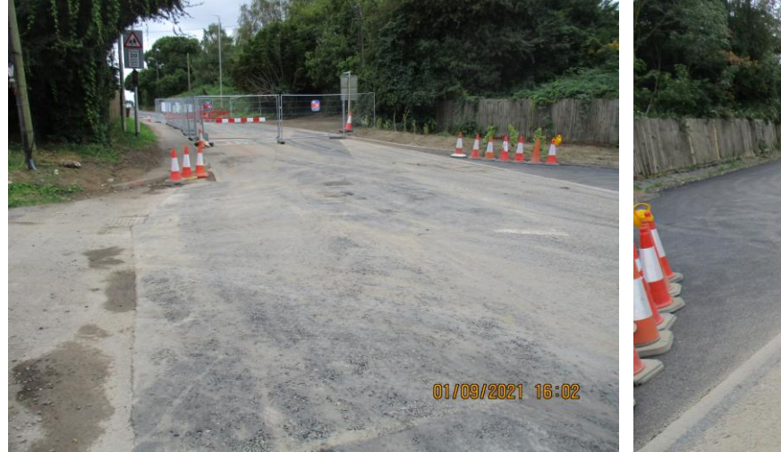
Slowly clearing the equipment and relaying damaged verges,.....including new hedging whips

All new tarmac, waiting for the white lining crew