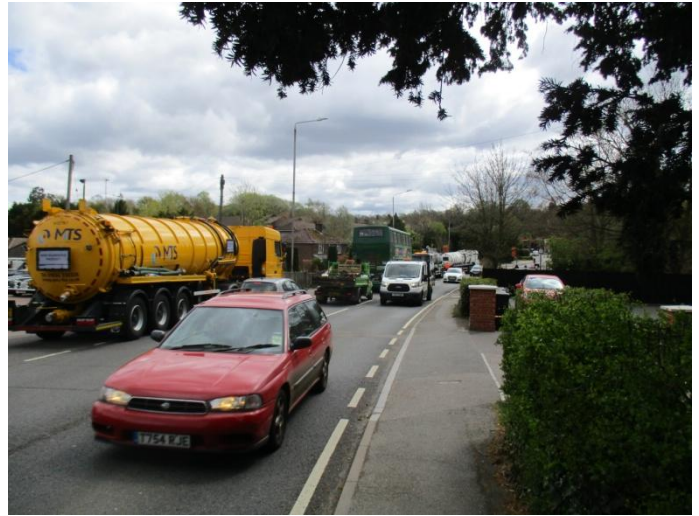
Tanker arriving at Maidstone Rd