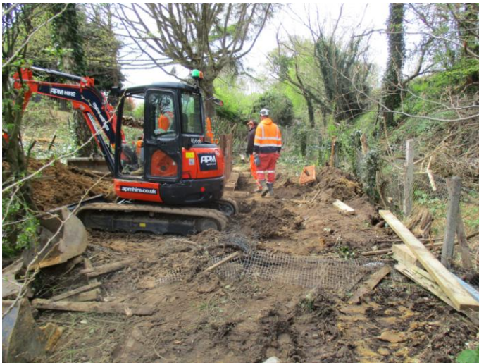
Site of third sewage breakout