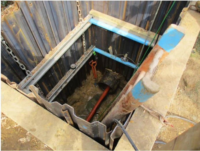
First Sandy Ridge Excavation