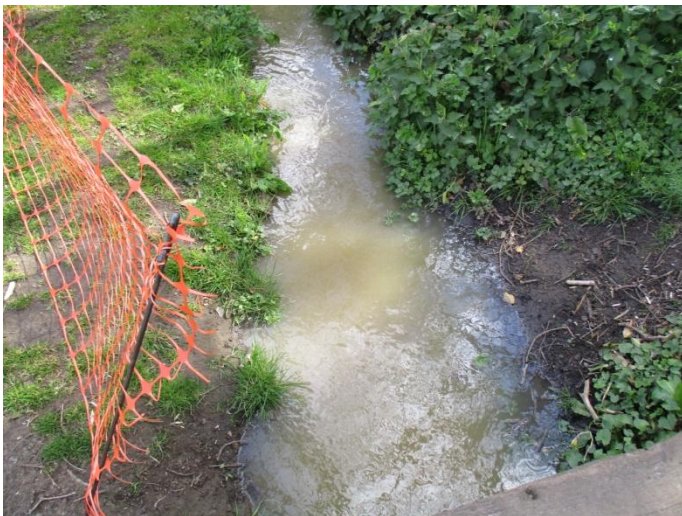
Recreation Ground Stream