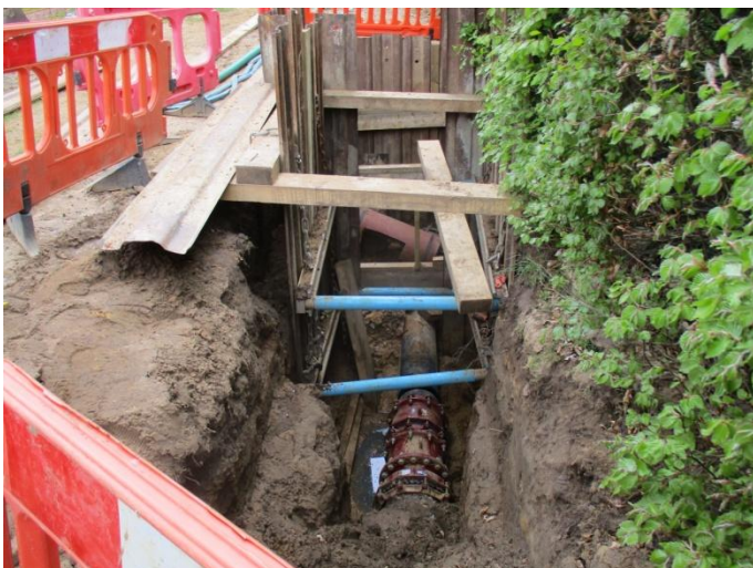
Second Excavation extended for pipe insertion